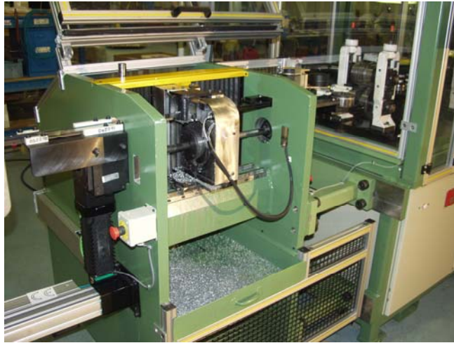
EC950 Shown with Guards open