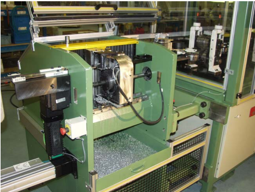
EC950 Shown with Guards open

*Tolerance is based on mill speed variation no greater than 0.04m/second during the cut.